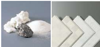
Slag wool and Shirasu Dai-Lotone