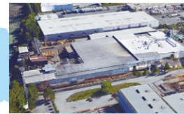
CIPA Lumber Co., Ltd. (Canada)