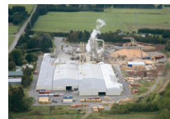
DAIKEN NEW ZEALAND LIMITED (New Zealand)