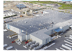
PACIFIC WOODTECH CORPORATION (USA)