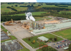
DAIKEN SOUTHLAND LIMITED (New Zealand)