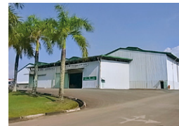
DAIKEN SARAWAK SDN.BHD. (Malaysia)